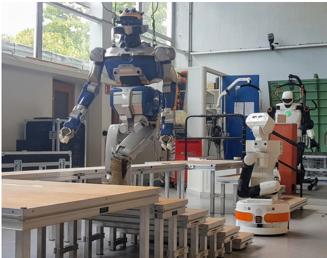
Figure 1: IR en robotique humanoïde